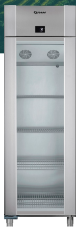
ECO PLUS 70 Vario silver