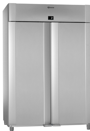
ECO PLUS 140 Vario silver