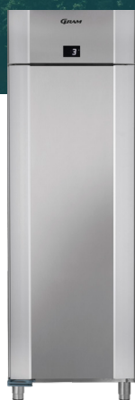
ECO PLUS 70 Stainless steel