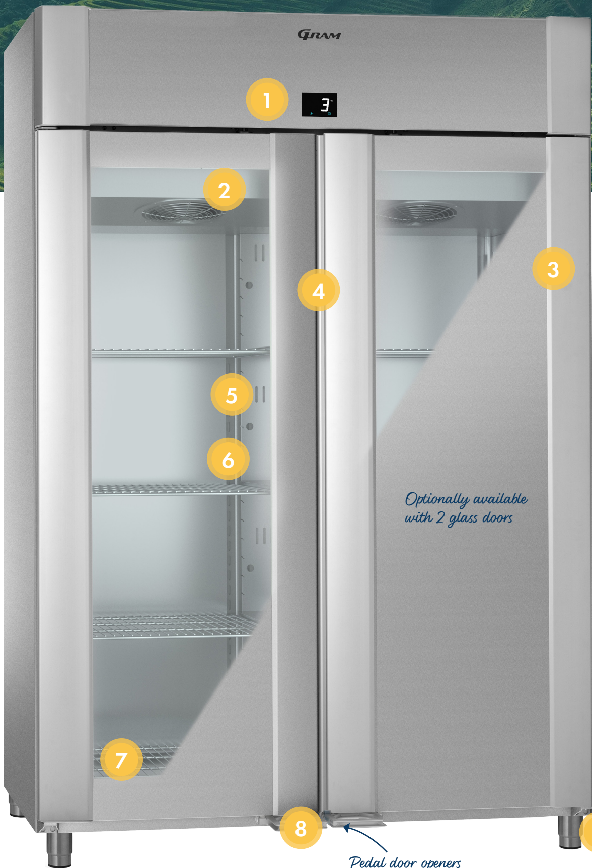
Pedal door openers