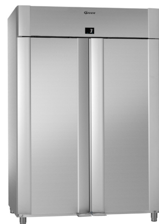
ECO PLUS 140 Stainless steel